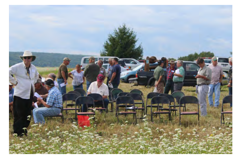
Participants at the 2015 buckwheat field day made a lot of good connections.

To make sure they had a crop at all, some buckwheat was sown as soon as it was possible to get in the field. Growers held off planting some fields for a couple of weeks. Because the rain stopped in early