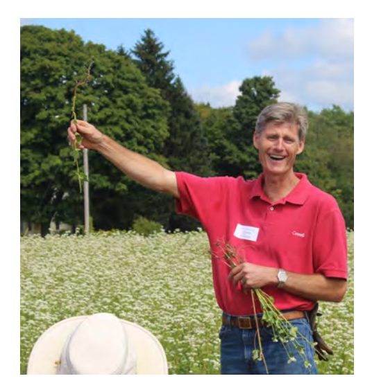
The plants revealed that seeding depth affected plant size considerably, whether too deep or too shallow. The plants were smaller.

The later plantings will have slightly lower maximum yield potential, but the early plantings were not going to reach that kind of potential. The trade-off was well worth it. The later plantings are at higher risk of an early frost before the green is mature, but that risk may be at higher elevations and northerly parts of the Northeast buckwheat-growing region.