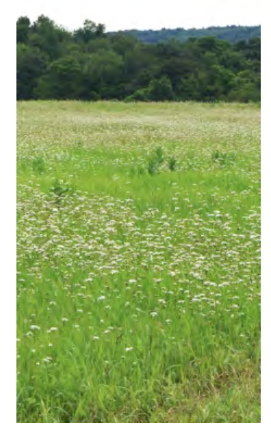
Wet ground at planting can result in a meadow of weeds with a few patches of buckwheat flowers.

Resilience to wet conditions paid off this year. That resilience is part of soil health, particularly soil aggregation and water percolation. Buckwheat contributes to that aggregation. In general, soil health is encouraged by having live or decomposing roots for as much of the year as possible, and by being parsimonious with tillage intensity.