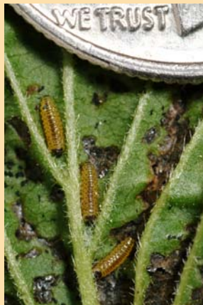
Larvae Hatch Late April-May