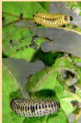
2nd, 3rd Instars May-June