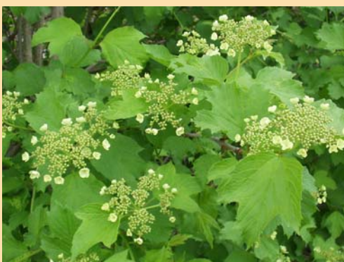
Is this innocent viburnum next?

If spotted: Don't panic. Take action to defend our country's viburnums. Join with other Citizen Scientists and report sightings to the Viburnum Leaf Beetle Citizen Science Project. Visit the VLB website for more pictures, management information, and online reporting forms for submitting your local observations.