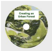
15 min. DVD, 16-page booklet