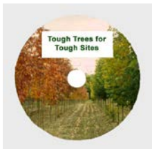
23 min. DVD