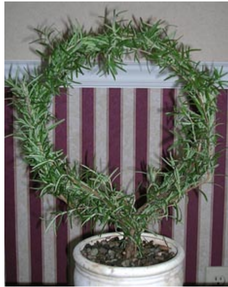
A 2-D wreath shaped frame planted with rosemary. http://www.post-gazette.com/pg/05330/612557.stm

In 2-D topiaries, plants are trained to a single-layer (flat) wire frame.