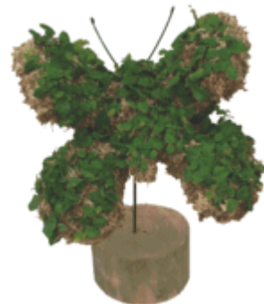
A 3-D butterfly shaped frame planted with ivy. http://www.topiaryartworks.com/tosmbu.html