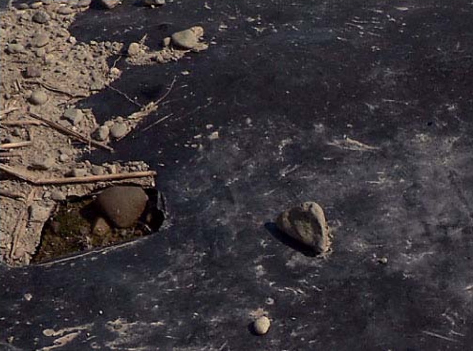
Biobag on July 20