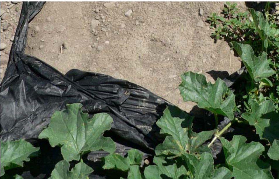
Biobag on August 8