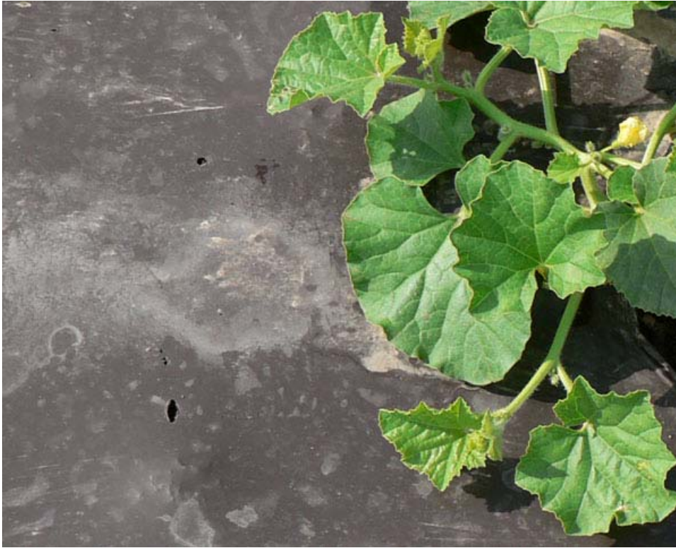
Brown Mater-Bi on June 29