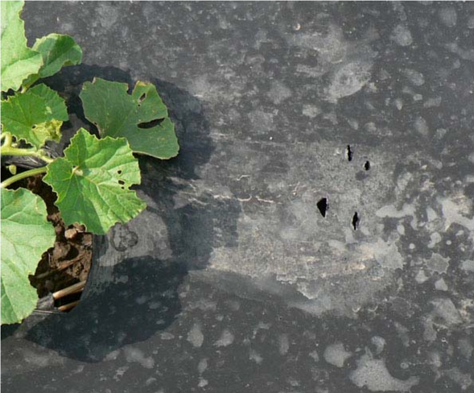
Black Mater-Bi on June 29