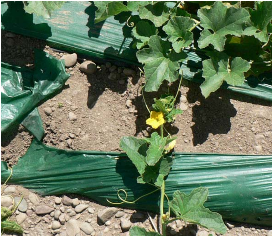
Green Mater-Bi on August 8