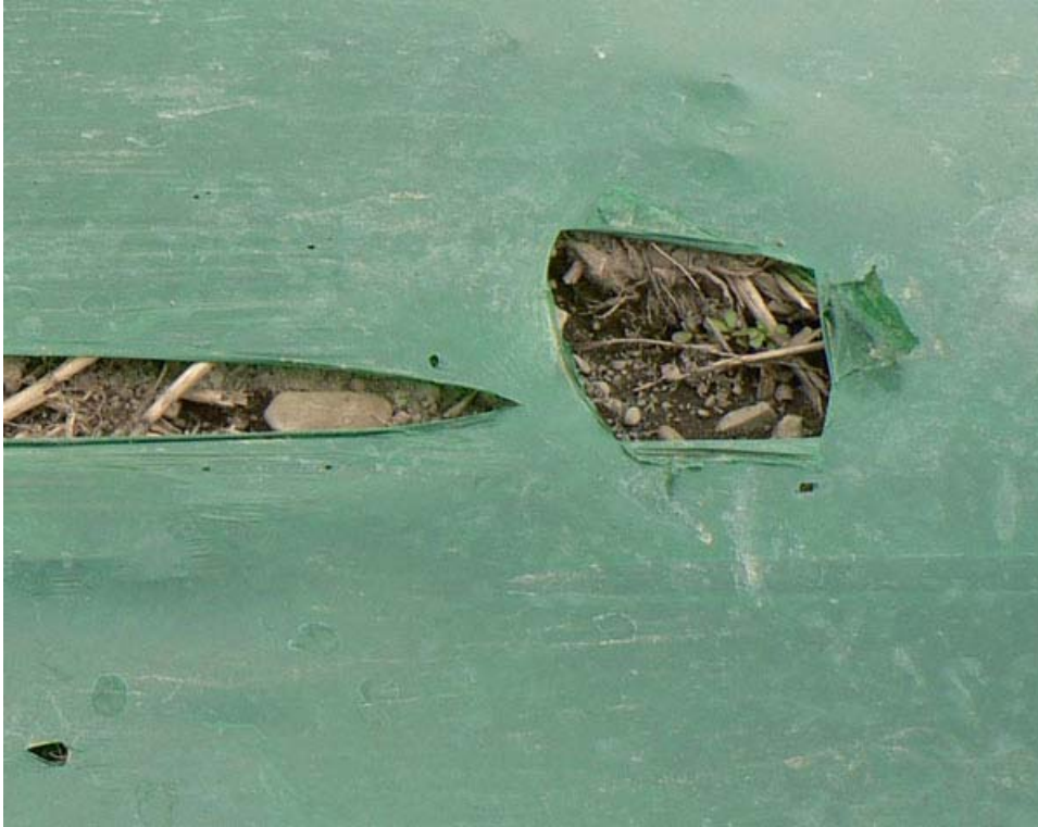
Green Mater-Bi on July 26