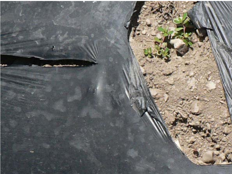
Black Mater-Bi on August 8