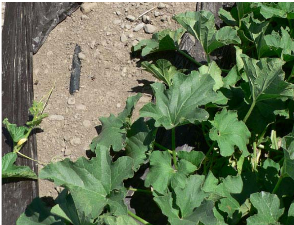
Brown Mater-Bi on August 8