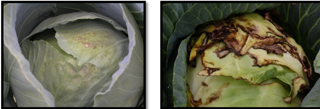
Figure 3. Mild (left) and severe (right) symptoms of downy mildew on cabbage. The severe symptoms are caused by secondary rotting pathogens moving into the downy mildew lesions.

The cole crop downy mildew pathogen, H. brassicae , produces wind-blown spores generally found on the lower leaf surface. These spores spread from plant to plant. Cool and wet conditions are necessary for spore production, germination and infection. The pathogen can also produce overwintering oospores that can survive in soil or crop debris. With the cool wet weather that frequently occurs in the fall in NY, it is difficult to control downy mildew. Resistant varieties (at least in cabbage) are a great option if downy mildew has been a problem on your farm. We have performed several fungicide trials, and have found several active ingredients to be effective including; chlorothalonil, mancozeb, fluopicolide, and copper (although not as effective as the others). In our trials plant defense-inducing products such as acibenzolar-S-methyl were not effective in downy mildew control.