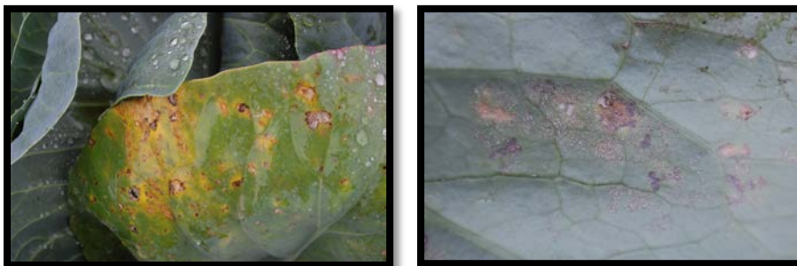
Figure 2. Images of mature cabbage leaves with downy mildew.