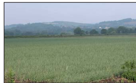
Example 2: Uneven field - 2 soil types (2 samples)