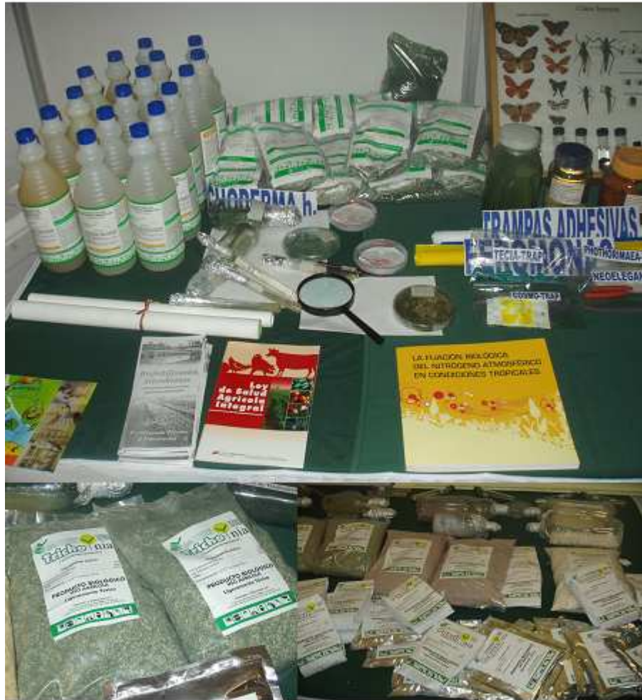
165x187mm (72 x 72 DPI)

1 2 3 4 5 6 7 8 9 10 11 12 13 14 15 16 17 18 19 20 21 22 23 24 25 26 27 28 29 30 31 32 33 34 35 36 37 38 39 40 41 42 43 44 45 46 47 48 49 50 51 52 53 54 55 56 57 58 59 60