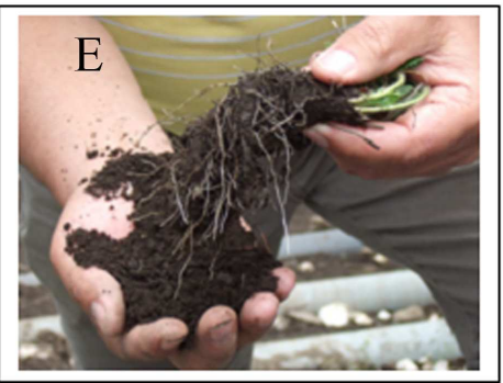
705x766mm (72 x 72 DPI)