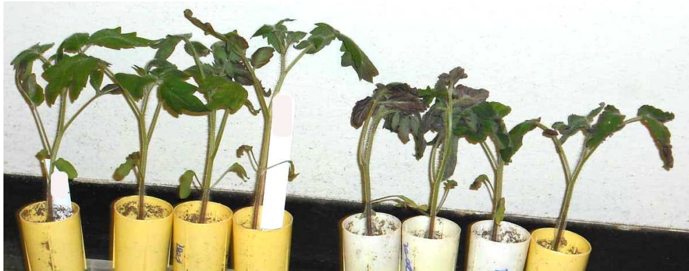
421x164mm (72 x 72 DPI)