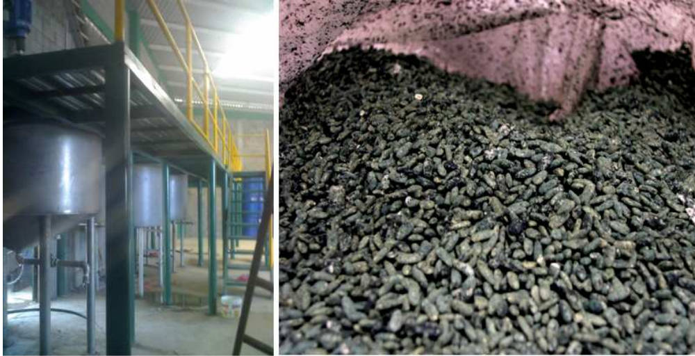
215x110mm (96 x 96 DPI)

1 2 3 4 5 6 7 8 9 10 11 12 13 14 15 16 17 18 19 20 21 22 23 24 25 26 27 28 29 30 31 32 33 34 35 36 37 38 39 40 41 42 43 44 45 46 47 48 49 50 51 52 53 54 55 56 57 58 59 60