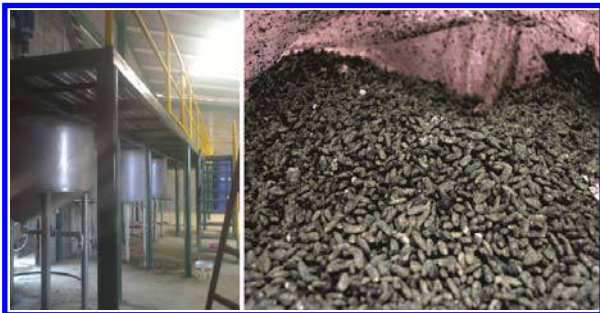
Fig. 3. Local production of biopesticides and biofertilizers based on selected strains of Trichoderma developed by the fourth author and that follows model 2 (inoculants, biofertilizers, and plant strengthening agents). On the left is shown basic fermentation facilities in Libya that are operating on relatively large farms. Batteries of fermenters containing different beneficial microbes are installed and connected directly to the irrigation system, thus delivering a liquid mixture of living microbes and metabolites that are freshly made and highly effective. On the right is shown production based on rice, as used in many countries; it is also arranged directly on the farm for internal use or sold locally. The colonized product is either ground and applied as granules, or spores are extracted and used for powder formulation. The fourth author and his colleagues use strains that were selected locally (In Libya, ability to grow at elevated temperatures is important.) or imported and that provide multiple beneficial effects (i.e., stress protection and growth promotion).

success. These strains may be isolated locally, but there appear to be strains that are adapted to a variety of crops and conditions that may be very widely used.