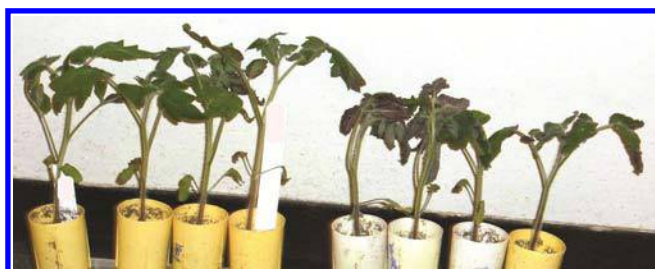
Fig. 1. Endophytic plant symbiotic fungi can provide benefits to plants that are greater than those provided by disease control alone. Tomato seeds were treated with a newly developed strain of Trichoderma (plants on left) or not treated, and planted in a greenhouse potting mix (Cornell mix, which is a mixture of peat, vermiculite, and nutrients). Plants were grown for about 8 weeks and then water was withheld for 2 weeks. Plants grown from treated seeds were more able to resist water deficit stress, an effect no doubt resulting from alterations in plant gene expression. Other strains also have this ability (4). This figure illustrates the advantage of endophytic strains and the requirement of advanced highly selected strains.

The necessity for strain selection. Microbial strains no doubt differ markedly in their abilities to control diseases, abiotic stresses, and to enhance plant performance and yield. Many of the genera of microbes just discussed as beneficial microorganisms are very common in soil and other plant-related environments. For example, nearly all soils in the world contain 10 to 1,000 CFU of Trichoderma spp. per cubic centimeter (40), but application of even very small amounts of selected strains, for example as seed treatments, can provide large benefits (Fig. 2). This is very likely because most strains are poorly able to colonize roots and establish endophytic relationships. Other attributes may be critically important to some uses, such as the ability to grow at high or low temperatures (Fig. 3), or to produce metabolites that are essential to