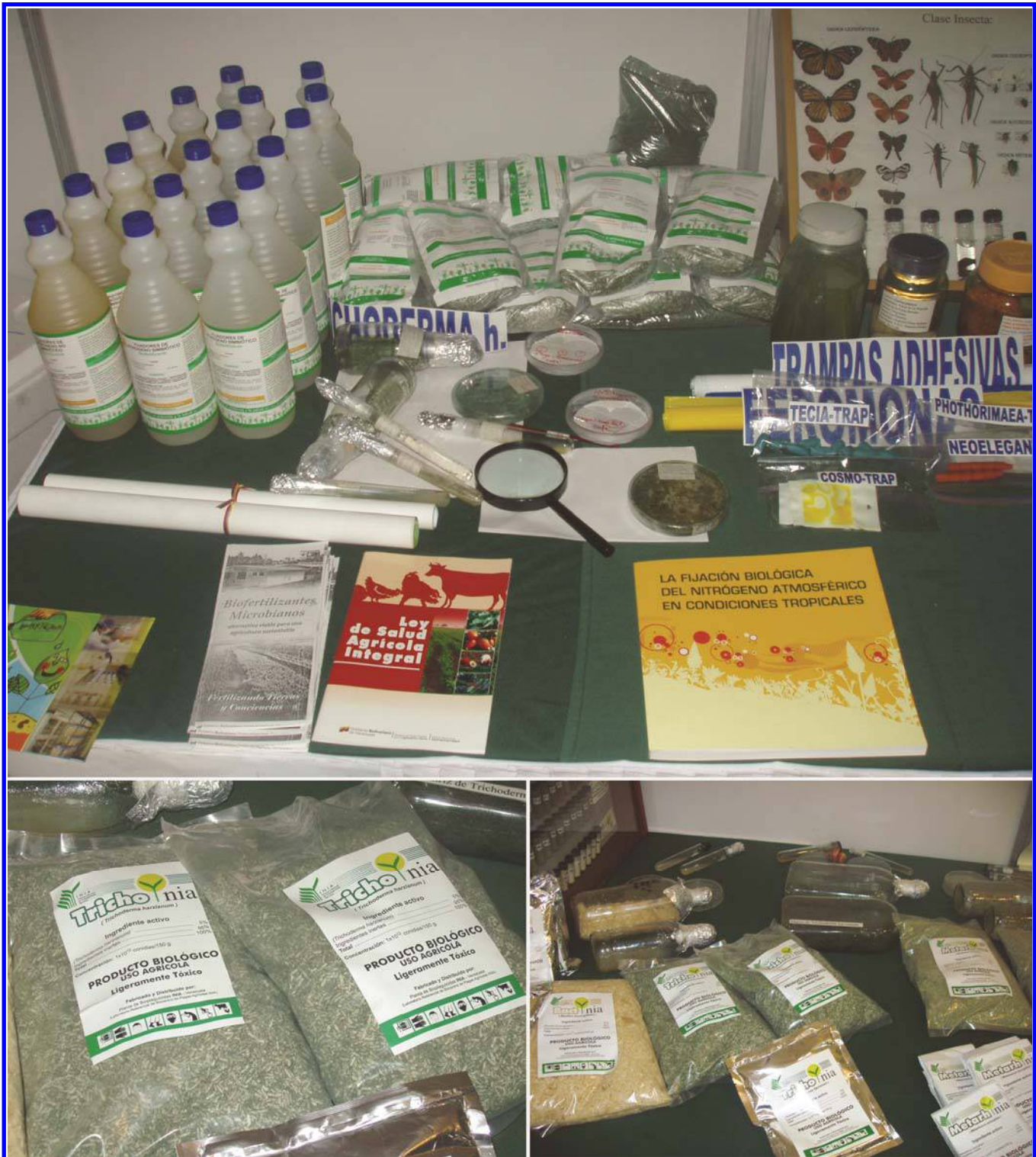
Fig. 5. Result of a government-run program to produce and use Trichoderma spp. and other biocontrol agents in agriculture in Venezuela. Products made by public, state-run research and production Institutions are made available free to farmers, along with information and learning material. In the picture are products distributed by the Instituto Nacional de Investigaciones Agrícola (INIA) in Venezuela.

In many countries, it is considered essential to develop reliable biopesticides and biofertilizers. For this reason, AAPARI advocates public-private consortia to help with the costs of development of