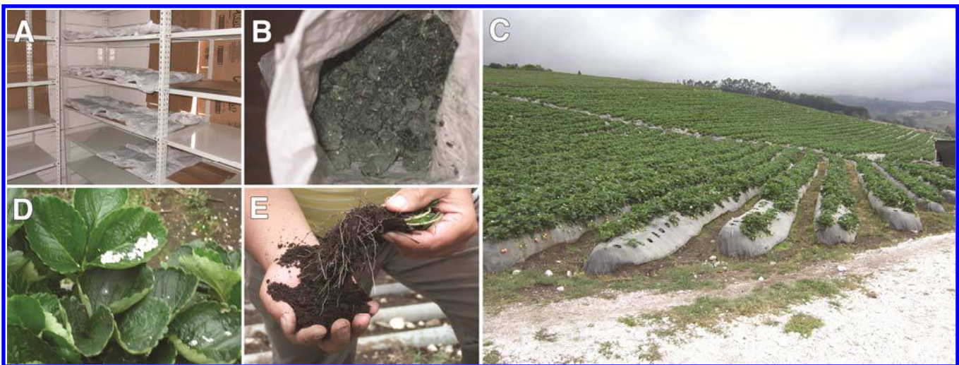
Fig. 4. Elements of the Costa Rican cottage industry. A , Trichoderma or other biocontrol agents are grown in small rooms on rice and in autoclavable bags. B , Upon completion of growth, the rice is thoroughly colonized and is ready for use. C , One site of application is strawberry fields on raised beds on plastic. D , At the time of planting, a high level (15 g) of colonized rice grains is placed in each planting hole in the plastic, and throughout the season, rice grains colonized by Trichoderma are spread by hand over the fields. E , Colonized grains also are applied in the nursery beds where roots are very healthy. In this system, this single biocontrol agent used in this way completely controls foliar, fruit, and root diseases in spite of the fact that this is a high rainfall area. Photograph is of fields treated using the system developed by the second author.

Need for additional economic models. Even though a variety of models are described above, there are still issues not easily addressed by them. Most notably, as described earlier, it is necessary that effective screening and selection systems be in place to pro-