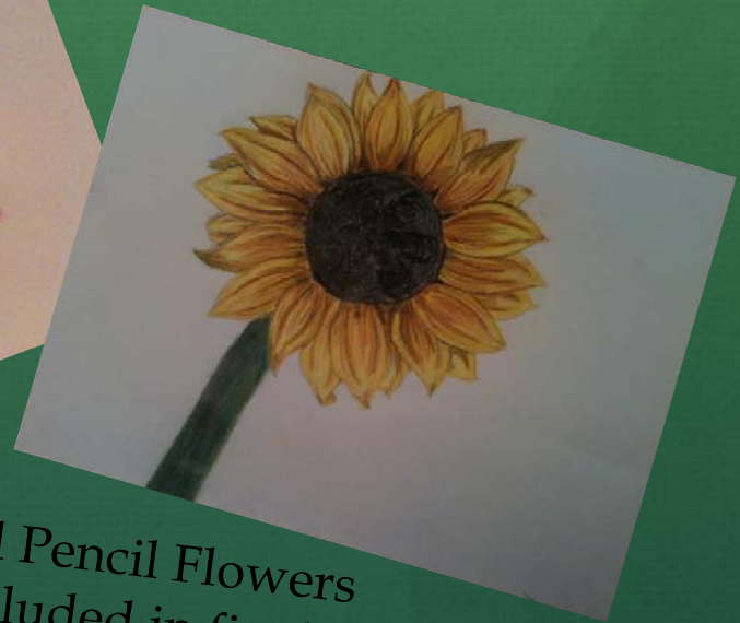
Colored Pencil Flowers (Not included in final project because they just didn't look right in the bouquet)