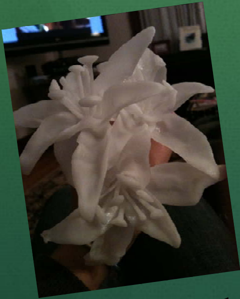
Plastic Flowers (made from moldable plastic pellets)

I started with the idea of a 2D and 3D combined bouquet