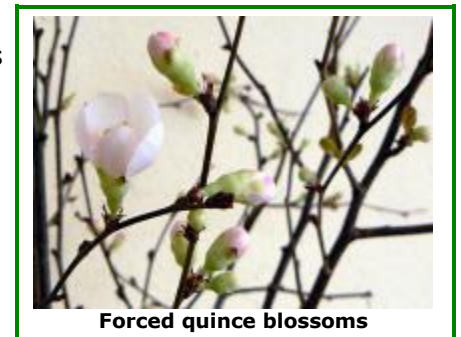
Forced quince blossoms

After gathering the branches, crush or split the lower stems a few inches from the bottom to increase the area exposed to water for better absorption. Then place the branches in a bucket or large vase of room temperature water. Beautiful blooms will begin to appear within a few weeks. And, what a sight for sore, winter weary eyes!