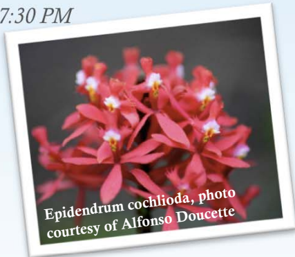
Epidendrum cochlioda

The Board of Directors will meet at 7 PM. The regular meeting will begin at 7:30 PM