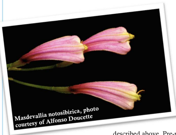
Masdevallia notosibirica

The Beautification Brigade takes care of all the public flower plantings in Ithaca. Have fun, learn gardening techniques, and help keep Ithaca gorgeous. Free dinner provided at the trainings. Free and open to anyone who wishes to volunteer with the program. Email dek22@cornell.edu , or call 272-2292 extension 123, for more information or to request a volunteer application