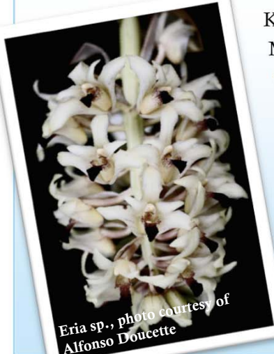
Eria sp., photo courtesy of Alfonso Doucette

March 12 th - 15 th www.rochesterflowershow.com/