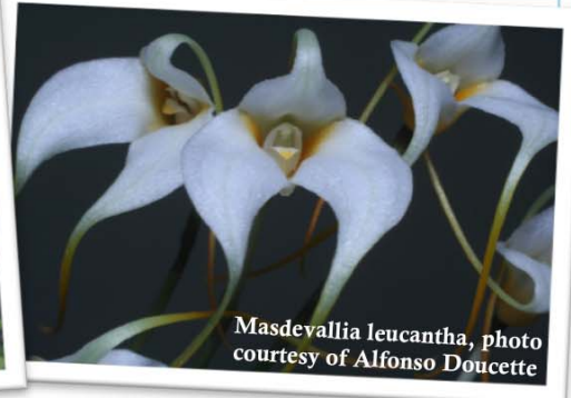
Masdevallia leucantha