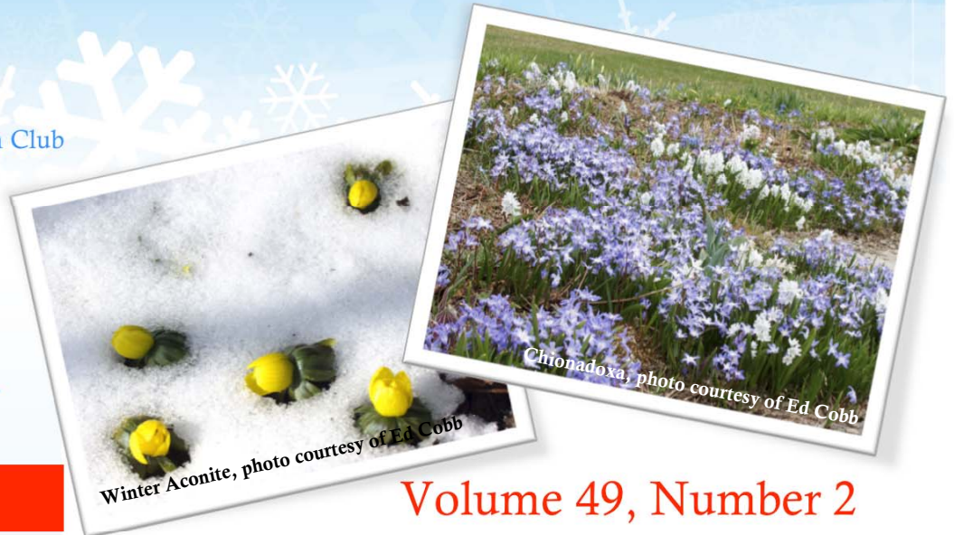
Winter Aconite

The Liberty Hyde Bailey Garden Club of Ithaca meets each month on the Second Tuesday at the Horton Room in the Floriculture Greenhouse, Tower Road Cornell University Ithaca, New York. The Club is open to all gardeners. Visitors are welcome.