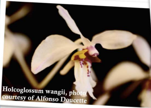
Holcoglossum wangii