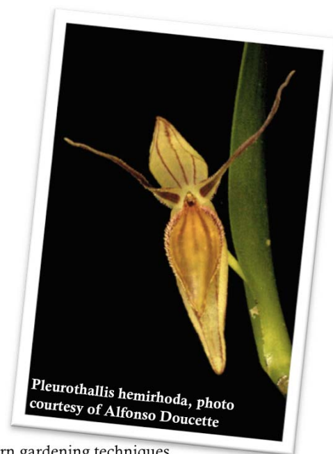
Pleurothallis hemirhoda